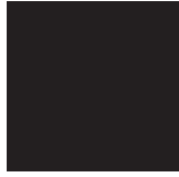
Black (Textured) powder coat