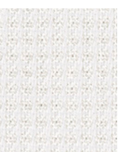
K1778/1 White Cap