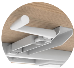
Standard and Speedy Crank