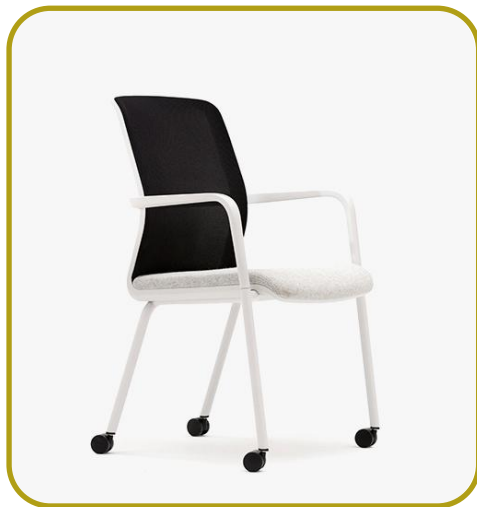
Circo Motion- CR7

In accordance with EN 15804+A2 and ISO 14040 / ISO 14044