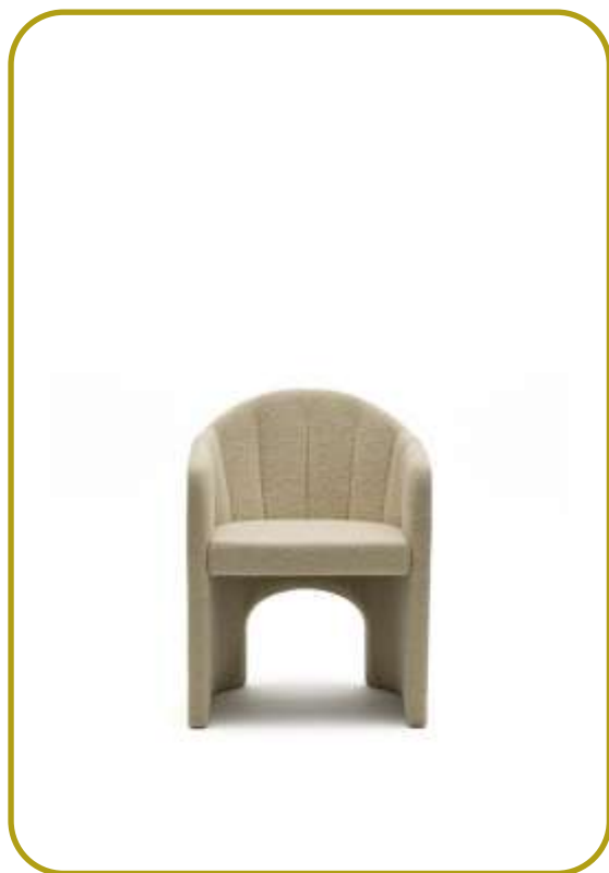
TLA100 Tola Armchair

In accordance with EN 15804+A2 and ISO 14040 / ISO 14044