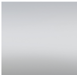
Silver Powder Coat