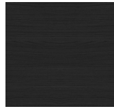
Black to Black