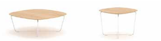
A638-32SS Low level soft square