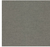
Kvadrat Melange Nap 111