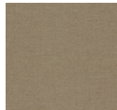
Kvadrat Melange Nap 211