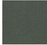
Kvadrat Melange Nap 951