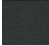
Kvadrat Melange Nap 191