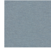
Kvadrat Melange Nap 711