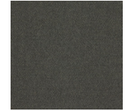
Kvadrat Melange Nap 271