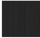
Back to Black