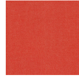
Kvadrat Melange Nap 521