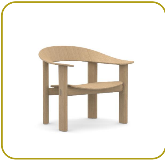
Curve Lounge- CUR101

In accordance with EN 15804+A2 and ISO 14040 / ISO 14044