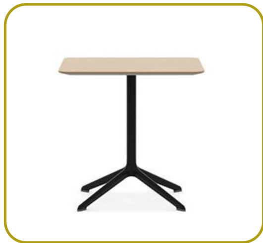
Axyl Table- AXLD07SQ

In accordance with EN 15804+A2 and ISO 14040 / ISO 14044