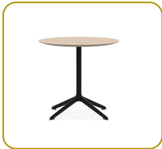
Axyl Table- AXLD08RD

In accordance with EN 15804+A2 and ISO 14040 / ISO 14044