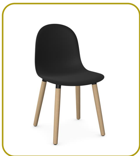
Kin Side Chair

In accordance with EN 15804+A2 and ISO 14040 / ISO 14044